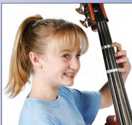
B: 4 th finger on G string