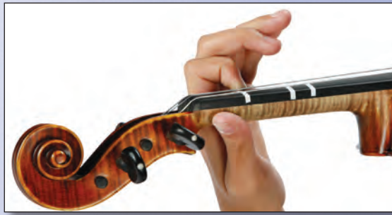
B: 1 st finger on A string