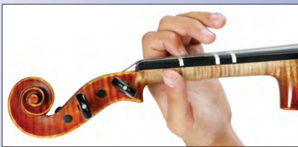
B: 1 st finger on A string