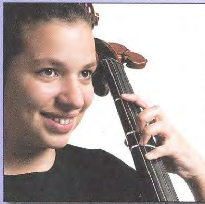
C# with forward extension