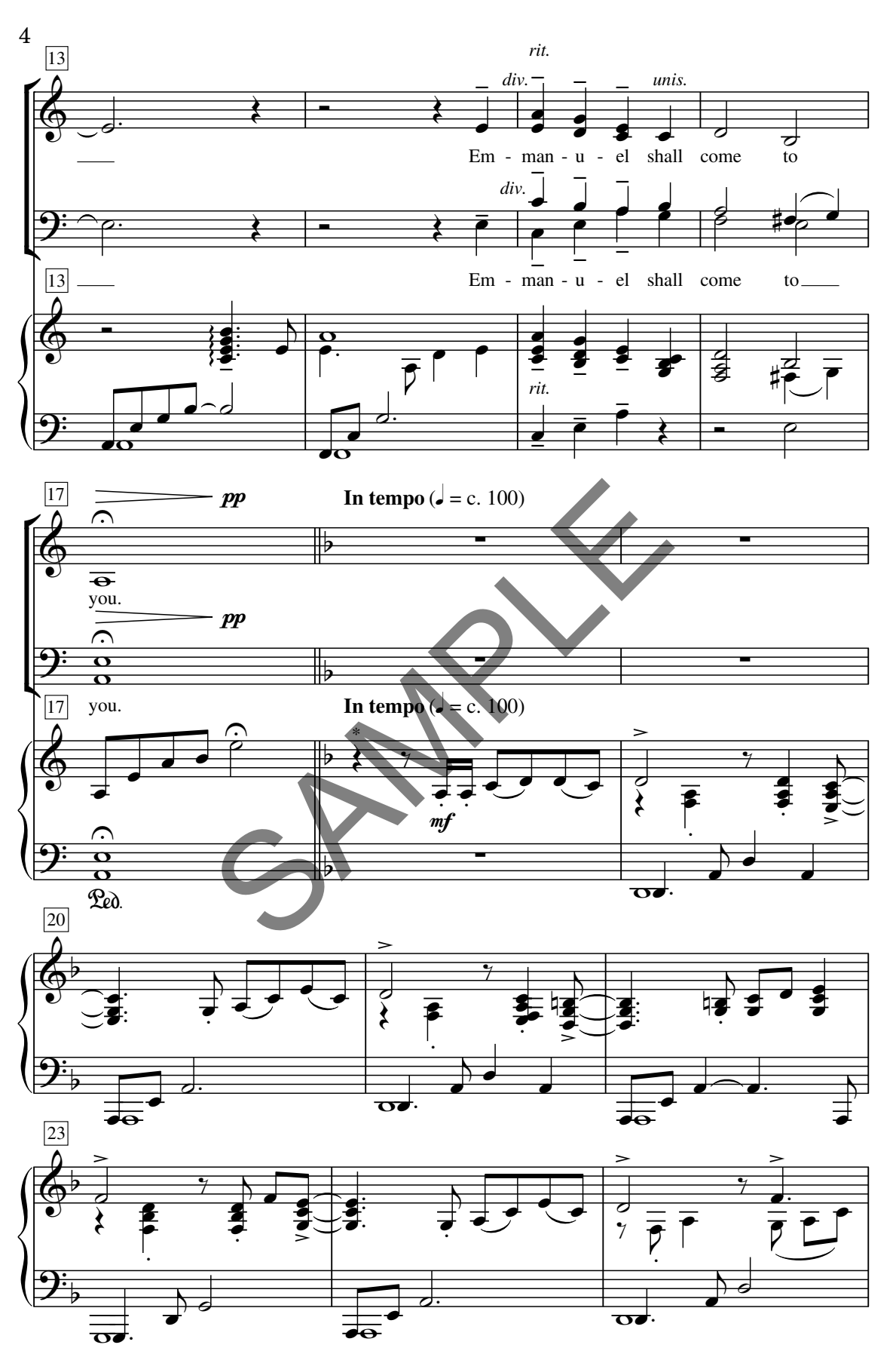
*Pianist may ad lib., especially in solo sections.