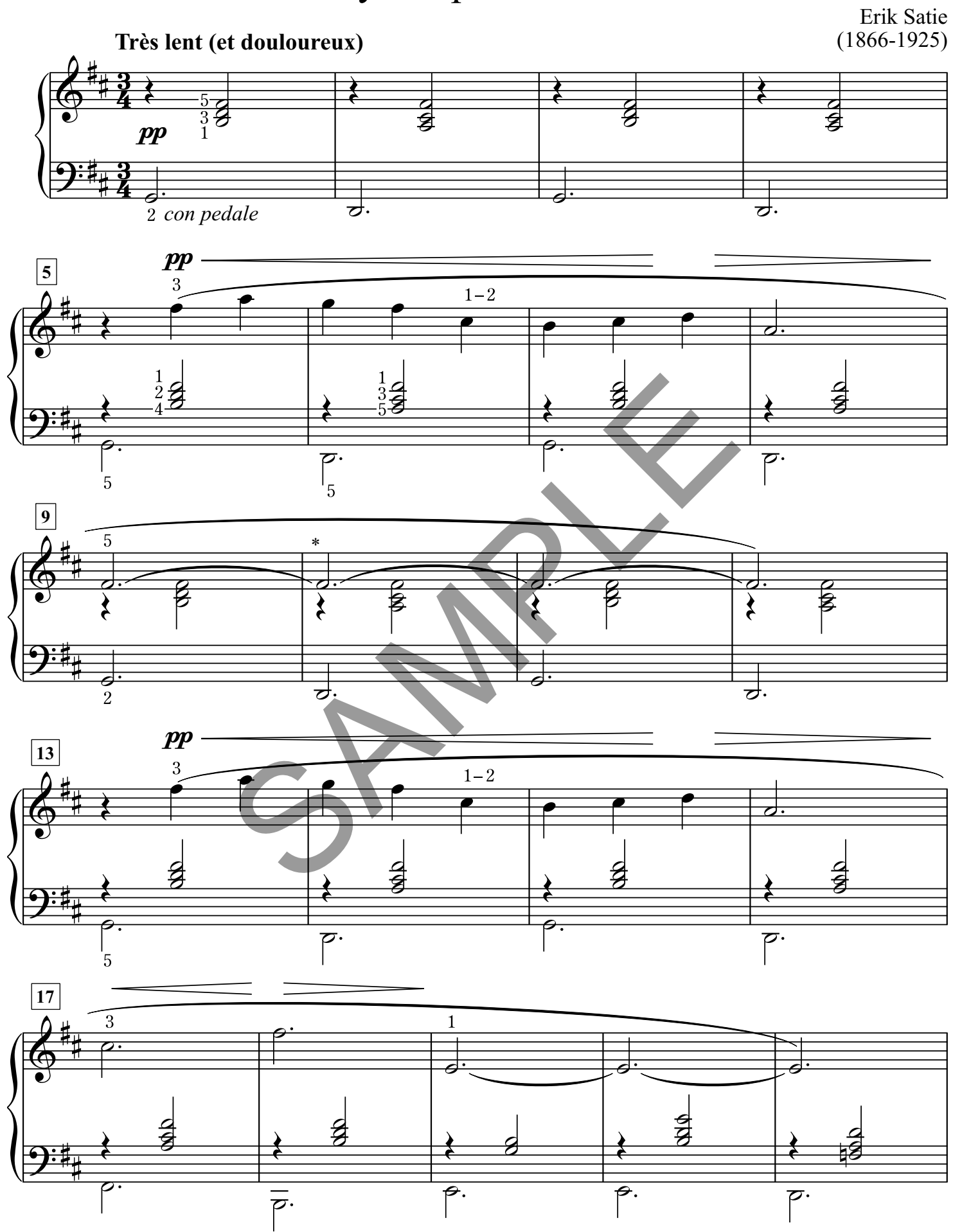
*To keep the F# sounding through these measures, hold the key down through the pedal changes on downbeats while releasing the other notes of the chords..