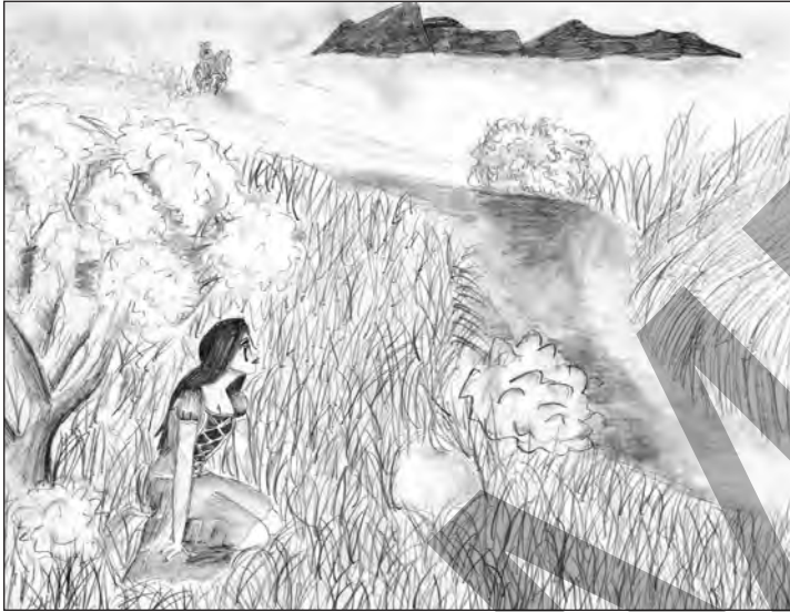
by Jillian Briare, Cellist, 7 th Grade

A sudden crack of a mighty tree limb startled the maiden, but as she reached to stroke the neck of her horse, she found that it was more spooked than she was. It bolted for the water. Even as she called into the wind, pleading for the beast's return, its legs pumped with purpose as it crossed back to the familiar side of the river. The horse never looked back as it charged into the forest, its mane wild in the wind.