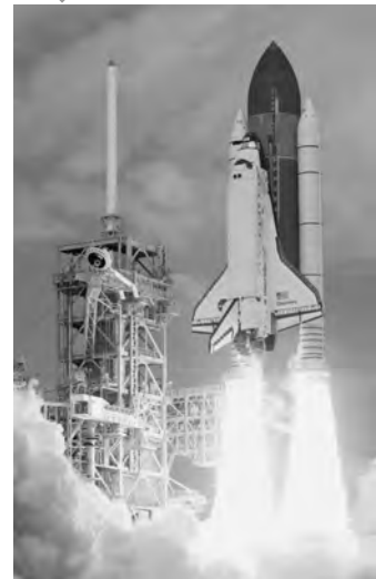
Launch of US Space Shuttle Discovery, 2007

Just think about the technology, or lack thereof, when these and other seafaring and space voyagers were out on their expeditions. What kind of maps did they have to work with? How did weather impact their journeys? What happened if something went wrong with the vessel they were traveling in? What did voyagers eat? Were voyagers ever scared?