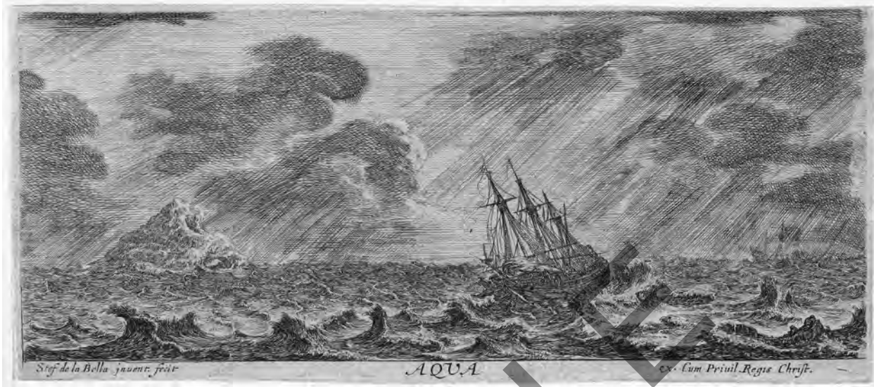
Water, a ship at sea during a storm, from "The Four Elements." Etching by Stefano della Bella (1610-1664)

A voyage is a long journey, most often an ocean trip or an expedition into outer space. Historically, there have been many successful seafaring voyages led by explorers who have discovered new lands and peoples. Amerigo Vespucci (1454-1512, Italian), Sir Ernest Shackleton (1874-1922 Anglo-Irish), and Sylvia Earle (1935- American) are just a few explorers who voyaged to reach new places and discover new things via often difficult ocean treks.