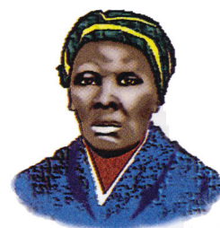
American abolitionist Harriet Tubman (1820-1913)