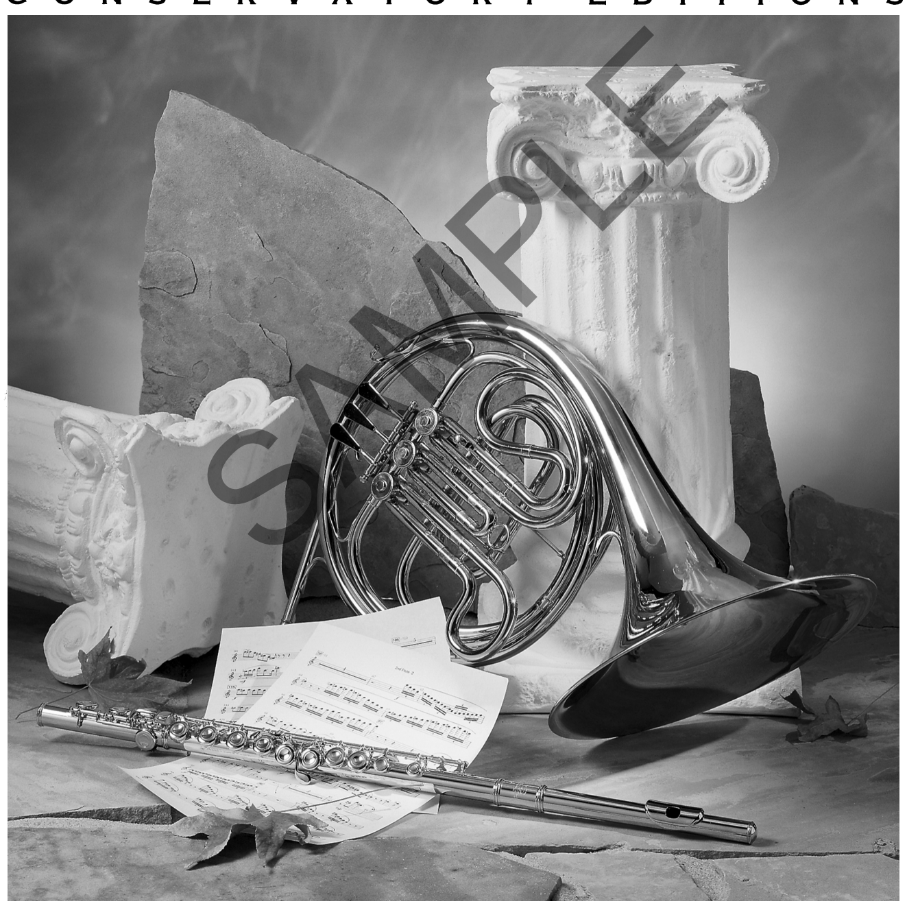
NEIL A. KJOS MUSIC COMPANY • SAN DIEGO, CALIFORNIA