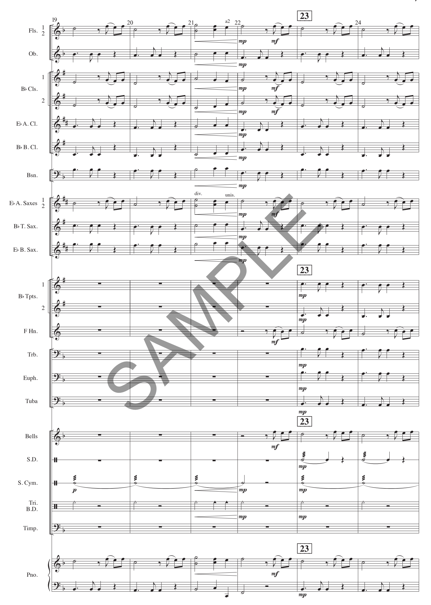
In a Royal Garden – WB557