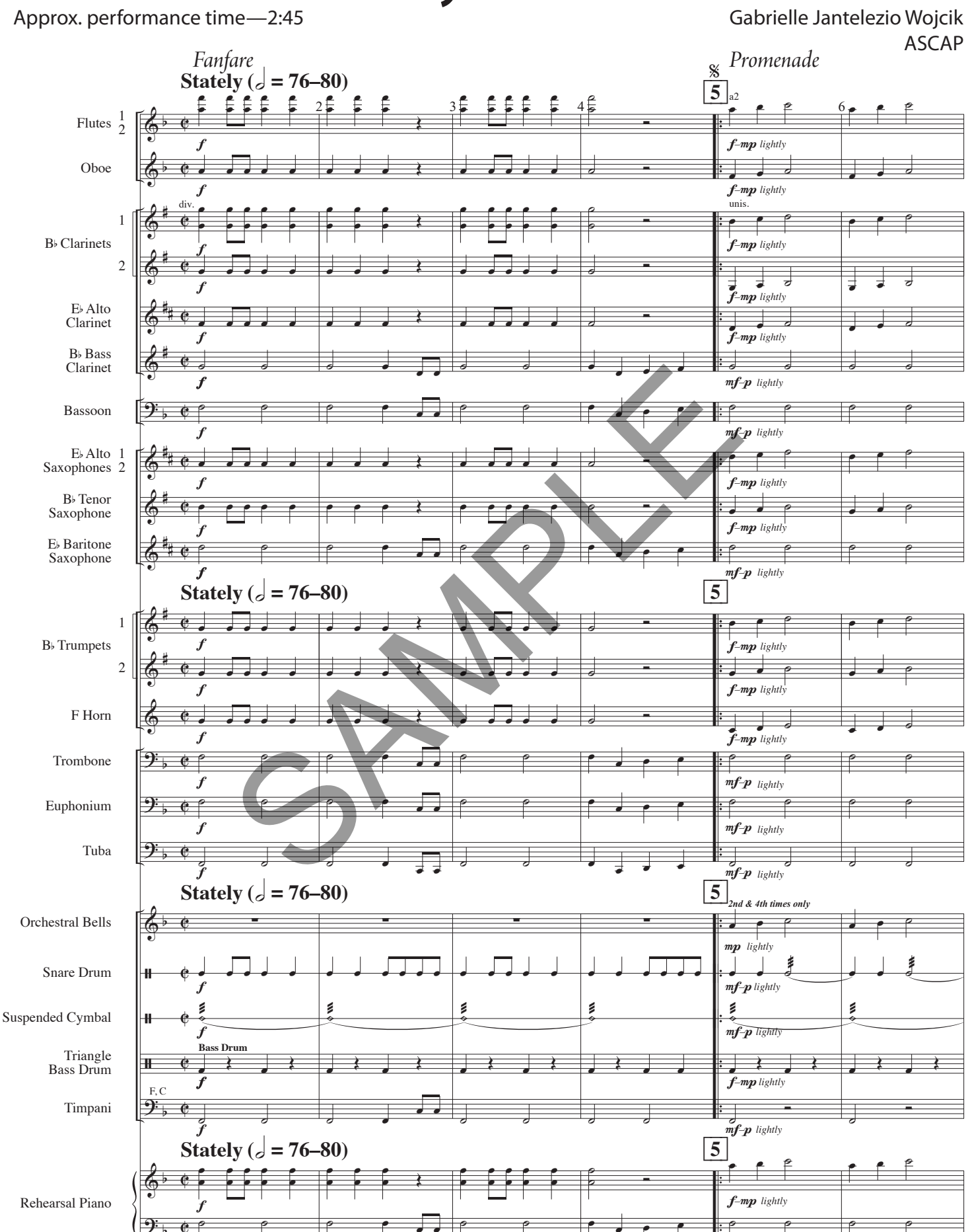
© 2024 Kjos Music Press, 4382 Jutland Drive, San Diego, California, 92117. International copyright secured. All rights reserved. Printed in the U. S. A. Warning! The contents of this publication are protected by copyright law. To copy or reproduce them by any method is an infringement of the copyright law. Anyone who reproduces copyrighted matter is subject to substantial penalties and assessments for each infringement.